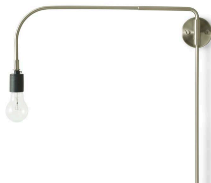
Brushed Steel 1950039