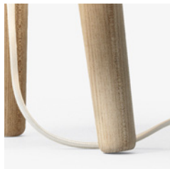
Untreated ash and white fabric cord