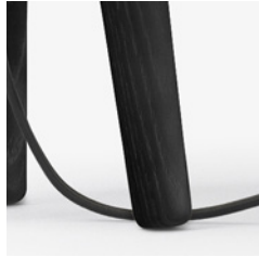
Black stained ash and black fabric cord