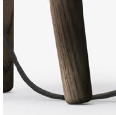
Smoked oiled ash and black fabric cord