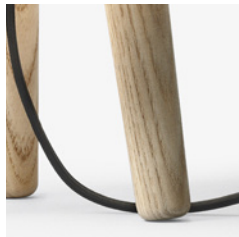
Untreated ash and black fabric cord