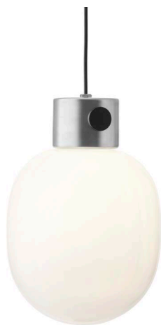
Brushed Steel 1820039