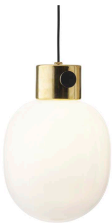
Polished Brass 1820839